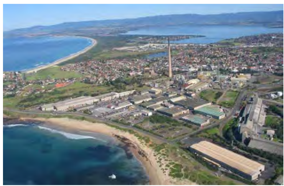
MM Kembla's Australian manufacturing facilities at Port Kembla.

MM Kembla manufacturing processes and quality systems are built upon 100 years of experience in manufacturing copper tube. An intensive ISO9001 certified quality control system is applied to all MM Kembla products. MM Kembla also has a variety of third party accreditations to Australian, New Zealand, British/ European and American standards.