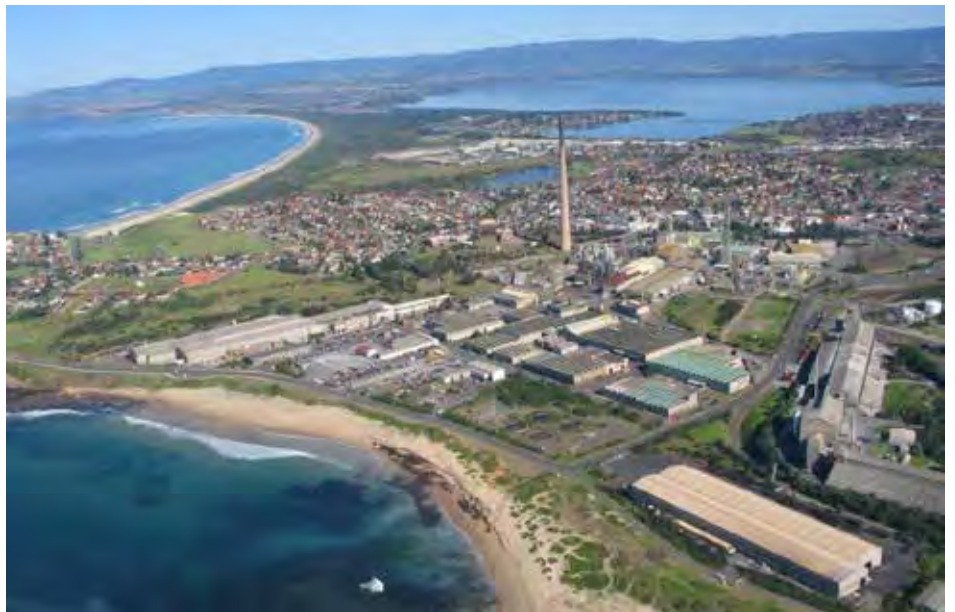
MM Kembla's Australian manufacturing facilities at Port Kembla.

MM Kembla manufacturing processes and quality systems are built upon 100 years of experience in manufacturing copper tube. An intensive ISO9001 certified quality control system is applied to all MM Kembla products. MM Kembla also has a variety of third party accreditations to Australian, New Zealand, British/ European and American standards.