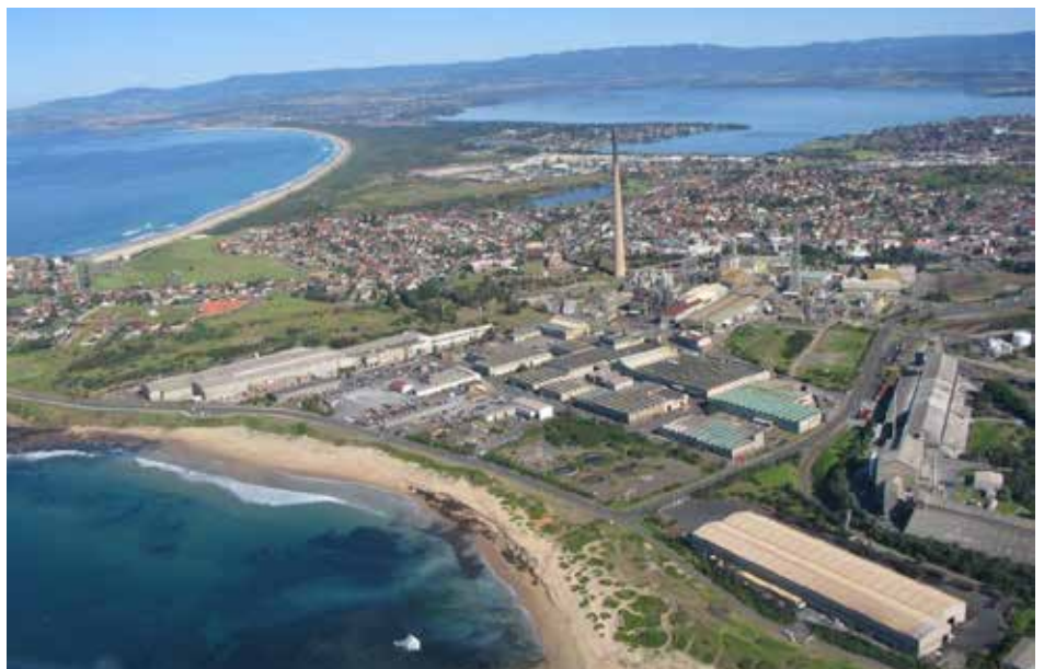
MM Kembla's Australian manufacturing facilities at Port Kembla.

MM Kembla manufacturing processes and quality systems are built upon 100 years of experience in manufacturing copper tube. An intensive ISO9001 certified quality control system is applied to all MM Kembla products. MM Kembla also has a variety of third party accreditations to Australian, New Zealand, British/ European and American standards.